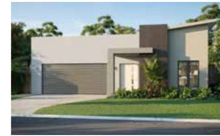
■ THE HAYMAN