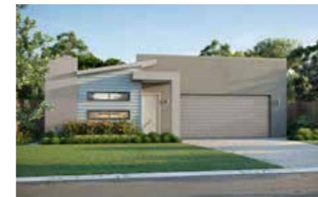
■ THE MILLMAN