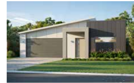
■ THE EAGLE