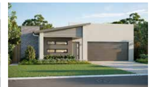
■ THE PIPER