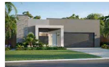
■ THE ORTON