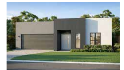
■ THE SHERRARD

The information contained and depicted in this Masterplan, including landscape treatments, road layouts, public utility infrastructure and location, is indicative only and is subject to any necessary development approvals and change without notice. In particular, the naming of places and streets within the development are subject to approval and may change. Prospective purchasers should make their own inspections and enquiries and take their own professional advice to satisfy themselves as to all aspects of the proposed development before entering into a Contract for Sale.