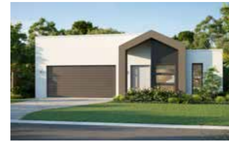
■ THE DAYDREAM