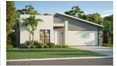
■ THE HUDSON