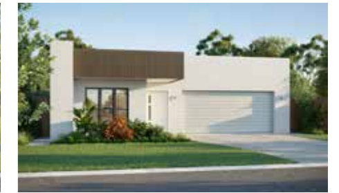
■ THE ERSKINE