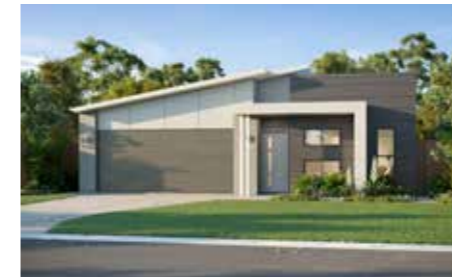
■ THE GLOUCESTER