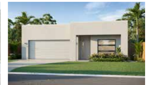
■ THE NEWTON