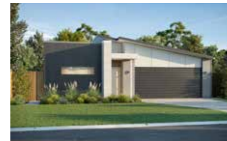
■ THE JARDINE