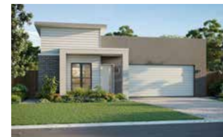
■ THE PELORUS